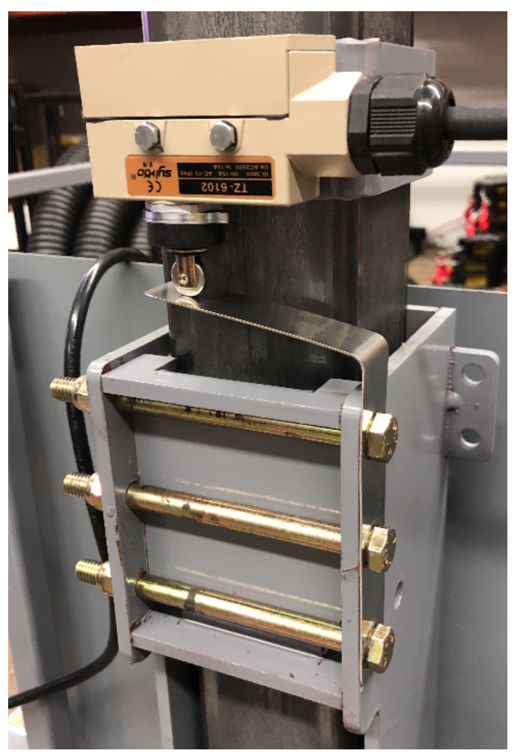
7.6. You will later adjust the up and down location of the Upper Limit Switch on the column in order to make the platform stop at the desired height.